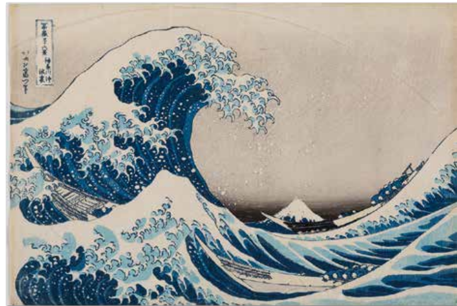
Cover Feature The Great Wave off Kanagawa by Katsushika Hokusai, circa 1831 Coming March 2025