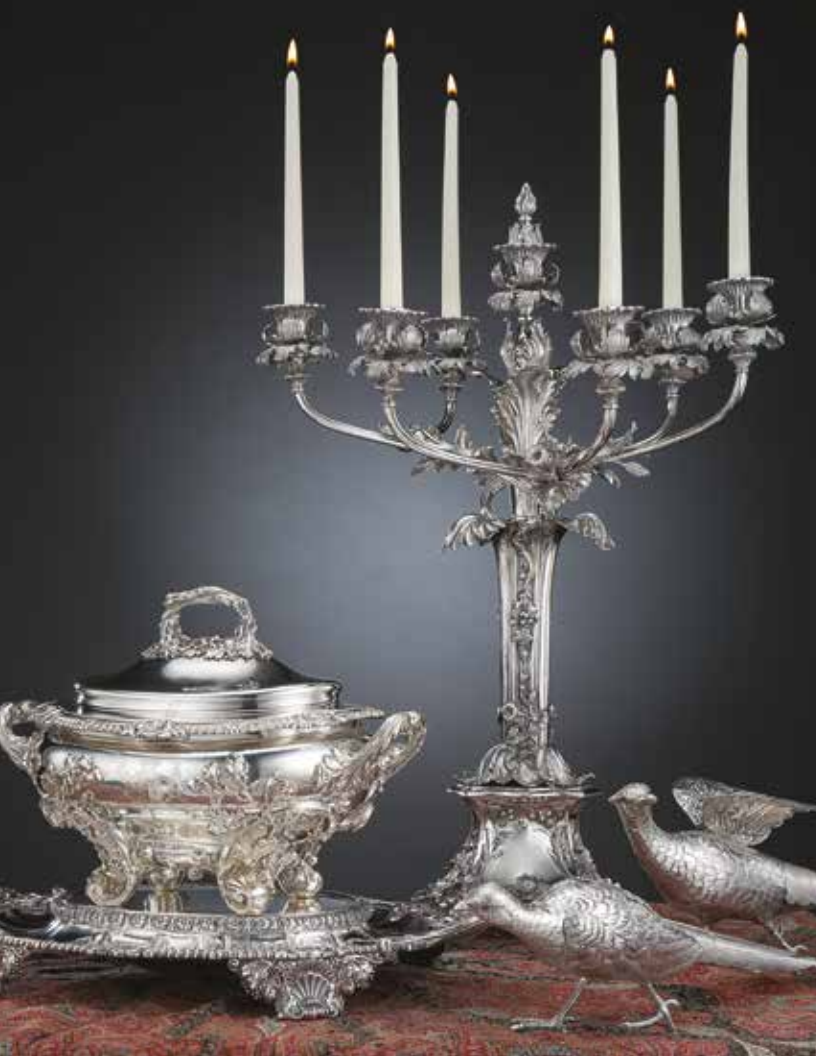
A John Bridge Silver Covered Tureen on Stand, London, 1827