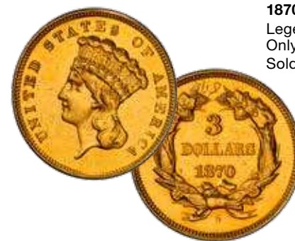
1870-S Three Dollar Gold, SP50 Legendary San Francisco Mint Rarity Only Available Example Sold for $5,520,000

Heritage was honored to offer The Harry W. Bass Jr. Core Collection over four auctions in 2022-2023. The historic assemblage of some of the rarest U.S. gold coins and die patterns soared past all expectations, bringing a combined total of $83.66 million. Proceeds from the sales will benefit the dozens of Dallas-based non-profits supported by the Harry W. Bass Jr. Foundation.