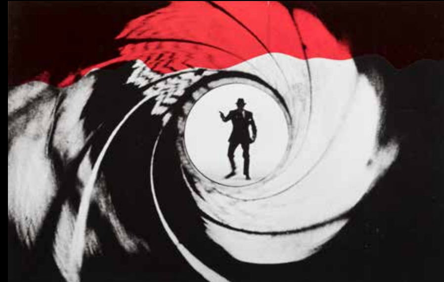
Maurice Binder Original Storyboard Title Sequence Artwork for Dr. No (Eon Productions, 1962) Sold for: $106,250