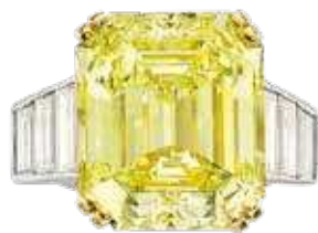
Fancy Intense Yellow Diamond Ring Sold for $591,000