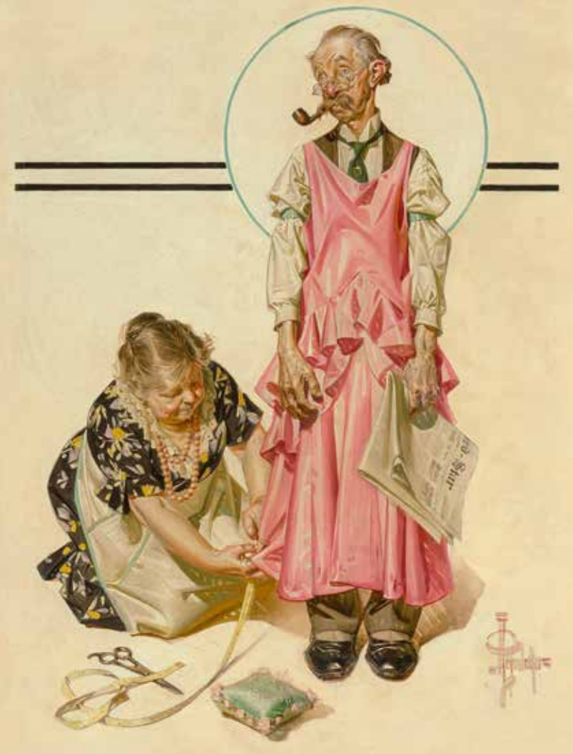
Joseph Christian Leyendecker (American, 1874-1951)

Living Mannequin, The Saturday Evening Post cover, March 5, 1932