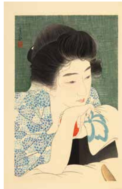
Morning Hair by Torii Kotondo, circa 1930 Sold for $50,000

On June 27, 2024 Heritage Auctions presented nearly 250 remarkable Japanese woodblock prints by masters like Katsushika Hokusai, Yoshida Hiroshi, and Torii Kotondo. The event achieved $2.212 million, far exceeding expectations. Highlights included: