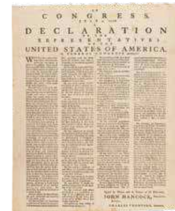
Declaration of Independence Broadside Sold for $2,895,000