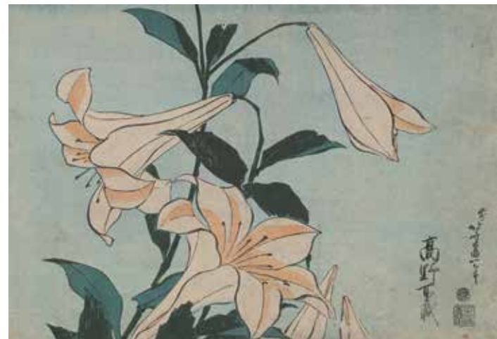
Lilies from the series Large Flowers by Hokusai, circa 1833 Sold for $156,250