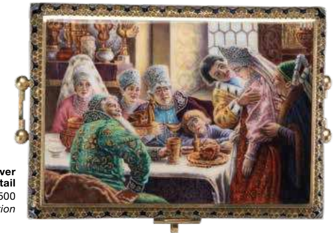
A Feodor Rückert En Plein and Cloisonné Enameled Gilt Silver Casket After Makovsky's Boyar Wedding detail

Our team is committed to presenting estates with complete solutions regardless of size and scope. Your Trusts & Estates Specialist will act as your primary contact throughout all stages of the valuation and sale process, advising you on how best to sell the property in order to achieve the highest returns for your single item or large collection spanning multiple categories.