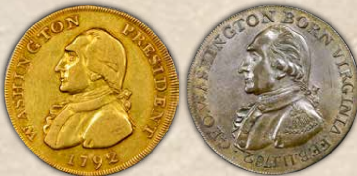
The busts of the Washington President (left) and the Washington Born Virginia (right) are identical and must have been made by the same engraver.