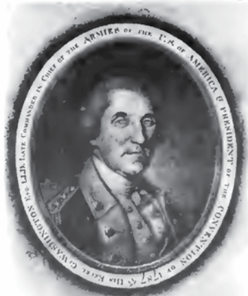
George Washington at the time of the Constitutional Convention, portrayed by Charles Willson Peale.

"I have a gold coin in my possession, a rough sketch of which I enclose; and which, although much worn, is still of the full value of the American eagle, namely, ten dollars. On inquiring at the United States' Mint, in Philadelphia, a few years since, I found that, in the collection there of specimens of all the federal coins, none like this existed. It attracted much curiosity; but nothing of its history could be learned. A very intelligent officer of the institution informed me, that he conjectured it was stamped in Birmingham. The name of Washington President, appearing upon it, renders it an object of greater interest; as it is generally understood, and believed, that while that distinguished man was president of the United States, learning that a coinage was about to be stamped at the mint, bearing his effigy, he immediately arrested the proceeding. A few copper coins had however been struck, which were never issued; and which I believe are still preserved in the collection to