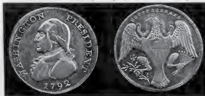
Unique 1792 WASHINGTON PRESIDENT 13-star pattern in gold, coined in Birmingham, England.